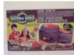
THE INCREDIBLE SHRINKY DINKS MAKER