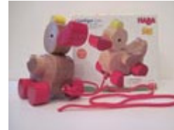
PULLING ANIMAL DUCK