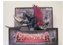
"GIGAN" GODZILLA FIG-URE