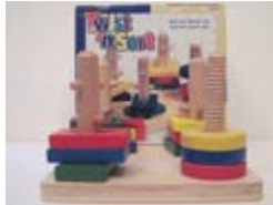
TWIST 'n SORT