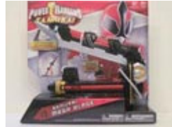
POWER RANGERS SAMURAI MEGA BLADE