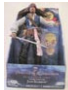
SWORD FIGHTING JACK SPARROW