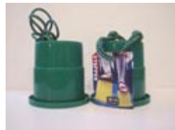
STEPPER "LOW RISE" STILTS