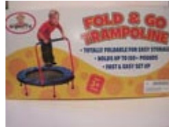
FOLD & GO TRAMPO-LINE